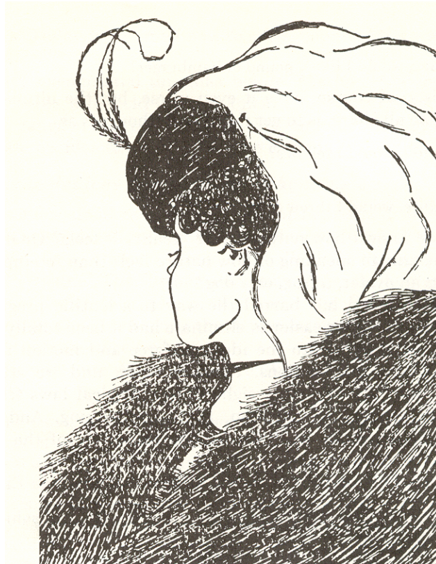
Figure 20.2.2. Some people perceive this image as an old hag seen in profile. Others perceive it as a well-dressed young woman looking away. Many people can see both images, being able to shift back and forth between them. Still other people are unable to see either.